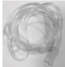
Tube and Cannula