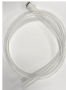
Water Drain Tube