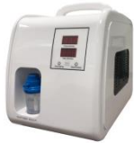
Halcyon Plus Inhalation